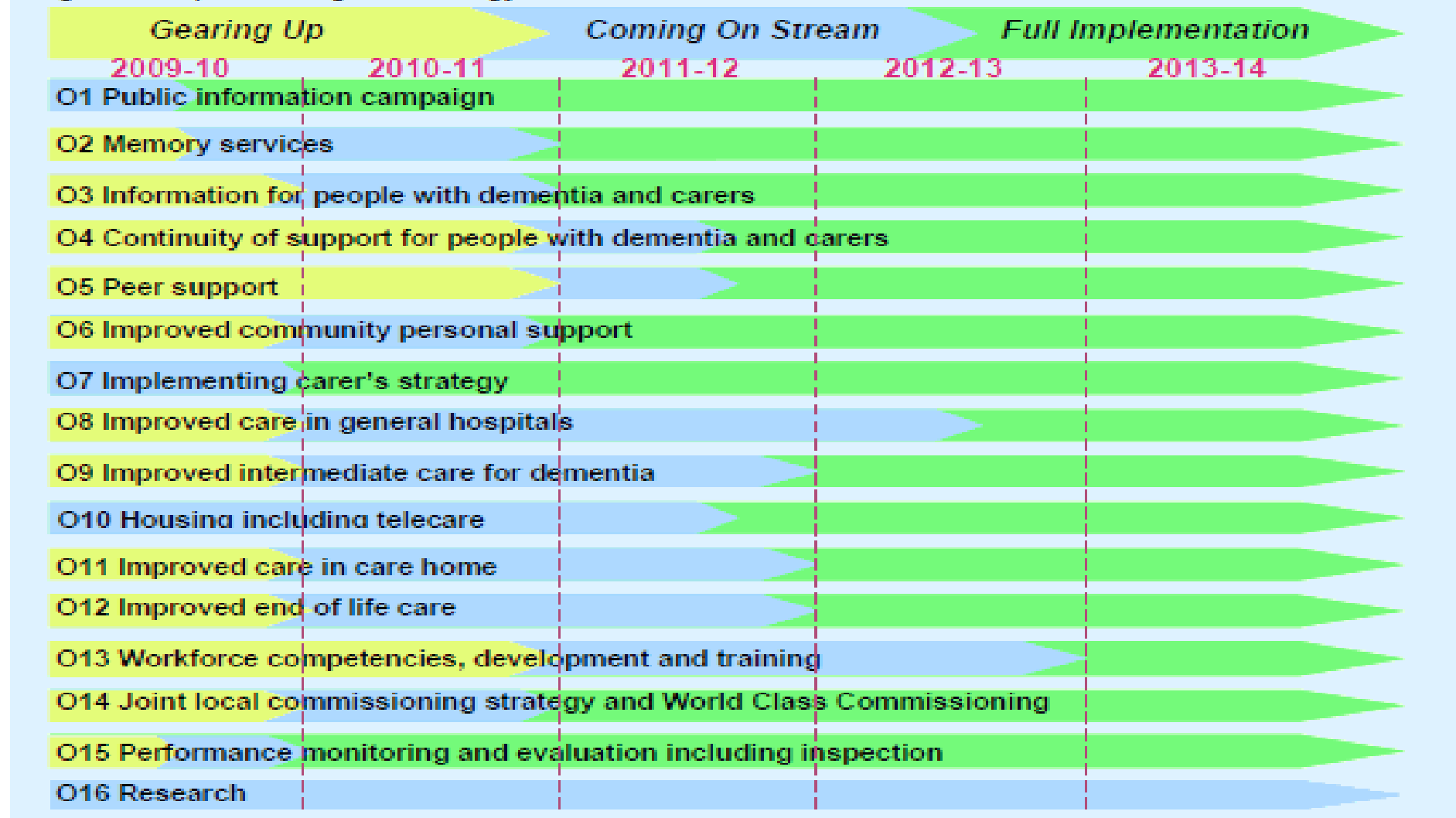
Figure 1: Implementing the Strategy: 2009 – 2014